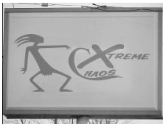
This sign equals Extreme Chaos

The father and son team have decided to offer discounts to students who improve their grades and to those students who already have good grades.