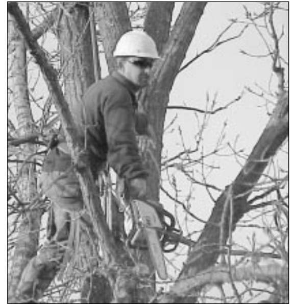
Trees Are Us employee goes out on a limb to keep the lights on in the country.

The Jay County Home School Association recently visited the Jay County REMC. The students and their parents discovered many interesting facts about electric cooperatives. The program also included information on renewable and non-renewable energy sources, how electricity is distributed, how electricity is measured, the dangers of electricity, what causes an outage and the specialized equipment worn by the lineman at the Jay County REMC. The students were also given a tour of the facility, bucket truck rides and participated in an electrical version of Bingo.