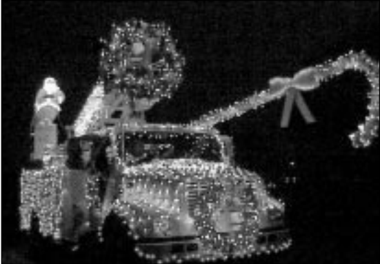
The best lighted vehicle in the Parade of Lights