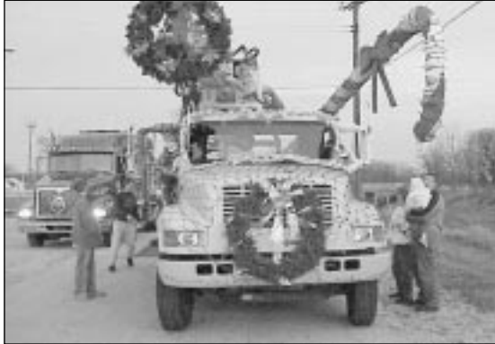
Parade of Lights

Jay County REMC won best-lighted vehicle at the Portland Parade of Lights. A special "thank you" to the employees and their family members who stayed after work to decorate the truck and take all the lights off after the parade.